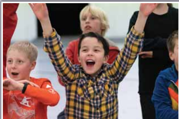
Mini Gang learn how to do "Crest of a Wave" – an essential skill!