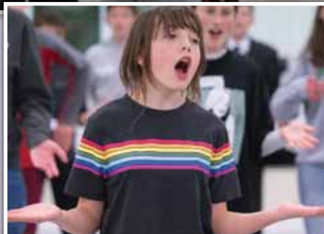
Junior Gang demonstrating their moves in November 2021!