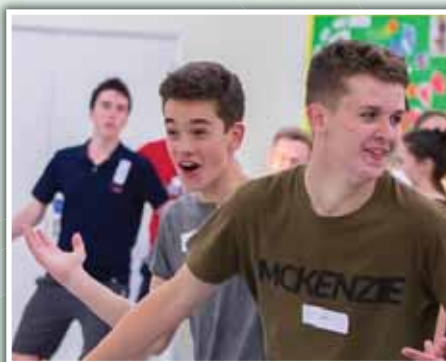
Trying out the Gang's moves at July's Preview Day!