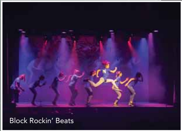
Block Rockin' Beats