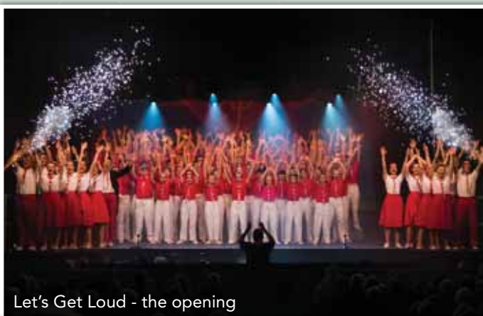
Let's Get Loud - the opening