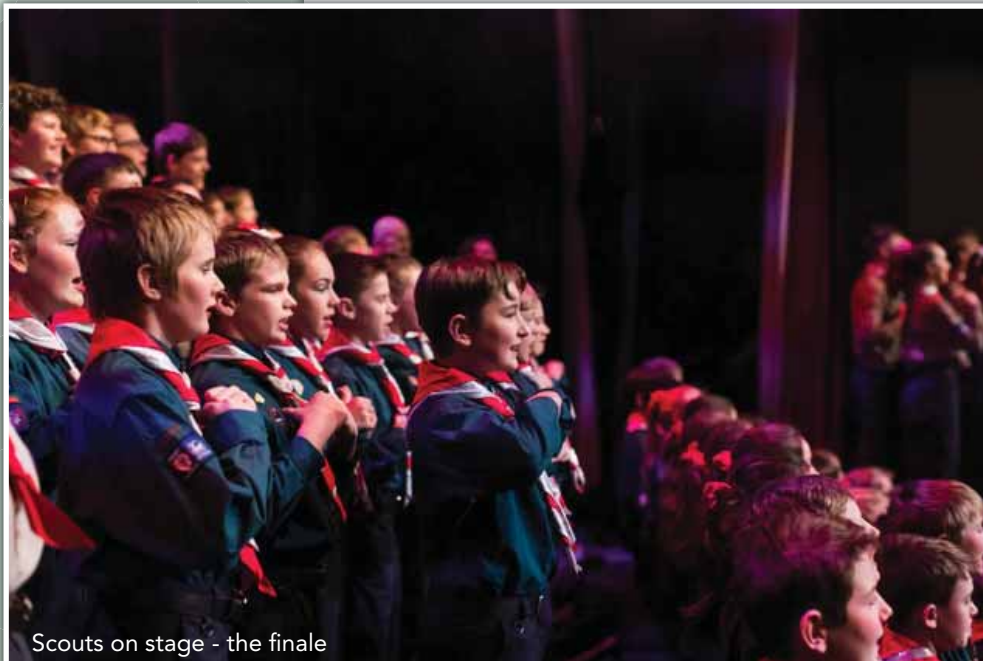
Scouts on stage - the finale